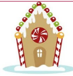
Grade 1 and Grade 8 prayer buddies making Gingerbread Houses.