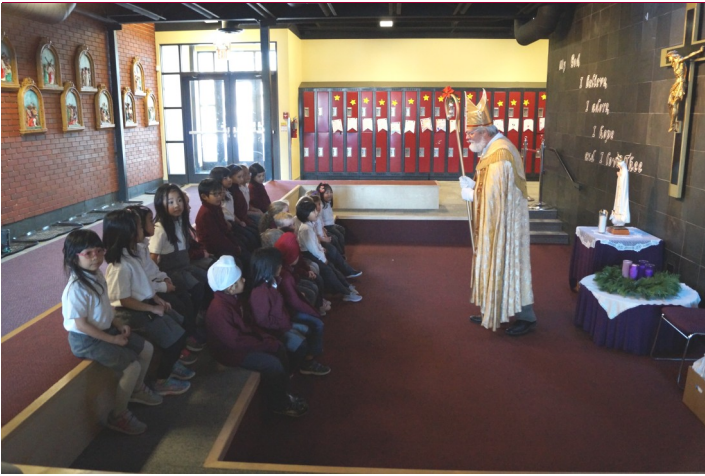
St. Nicholas visited the students and staff of HGS, giving out treats to everyone! Thank you! St. Nicholas and the Knights of Columbus of Holy Ghost Church